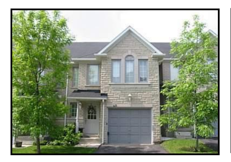
LOCATION: ... just north of Eglinton and west of Mississauga Rd on a quiet crescent in an exclusive neighbourhood.. This luxury townhouse provides easy access to the 403, the Go Train station and major shopping at Erin Mills Town Center. A 24 HR grocery store is just minutes away.